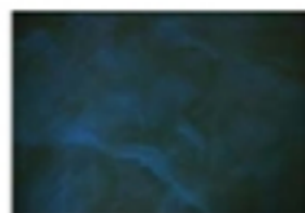
MIDNIGHT BLUE (black base)