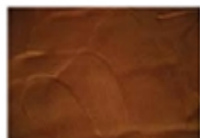
COPPER (black base)