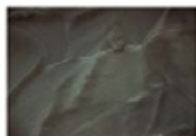
GUN METAL (black base)