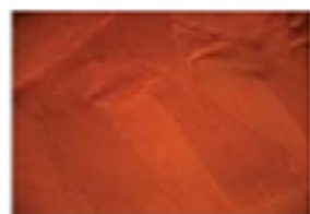
BURNT ORANGE (black base)