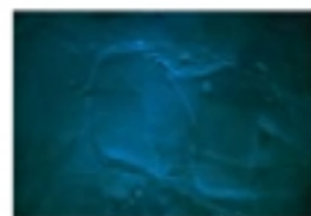
ROYAL BLUE (black base)