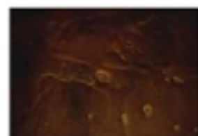
SEQUOIA (black base)