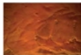
BRASS (black base)