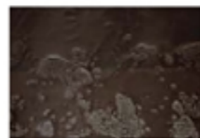
CHARCOAL (black base)