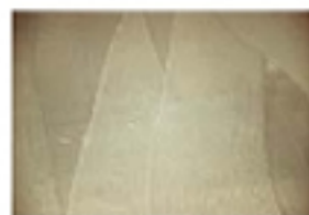
PEARL (black base)