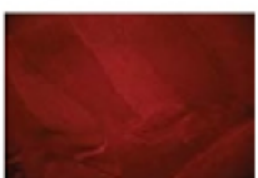
WINE RED (black base)